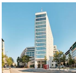
Springer Quartier Hamburg