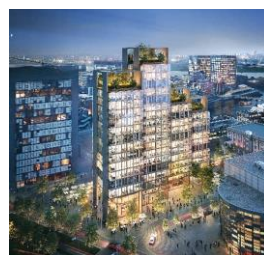
UNIQ Towers Dusseldorf